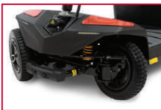
Exclusive iTurn Technology®