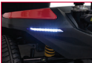
Full LED lighting package

Get a 4-wheel scooter with a 3-wheel turning radius with the Pride® Zero Turn Scooter and Pride's patented, intelligent-turning technology™. Navigate tight corners and small spaces effortlessly with a 97.2 cm (38.25") turning radius. Illuminate your ride with bright LED lighting, while the Zero Turn's dual motors and CTS Suspension ensure a smooth and comfortable drive.