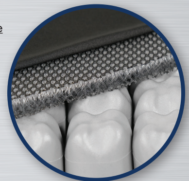
View of 3D mesh

CG Air Deluxe is the tailor-made version that best meets the unique needs of each user. The production of a customized mold allows us to alter cell heights and modify the shape of the cushion's compartments.