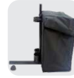
Rear Shopping Bag