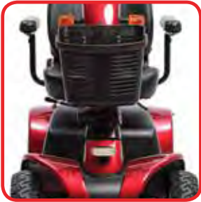
Front Light Package

Get superior performance at exceptional value with the Pathrider 130XL Pursuit . Front and rear suspension combine with large 33 cm (13") wheels to handle rugged outdoor terrain. The easy-drive delta tiller allows for simple, one handed operation and LED lighting package enhances visibility for a safe and smooth ride.