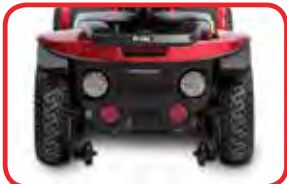
Rear Light Package